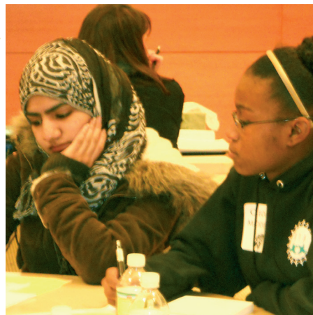
Students participate in a forum on addressing violence as a public health issue last winter.