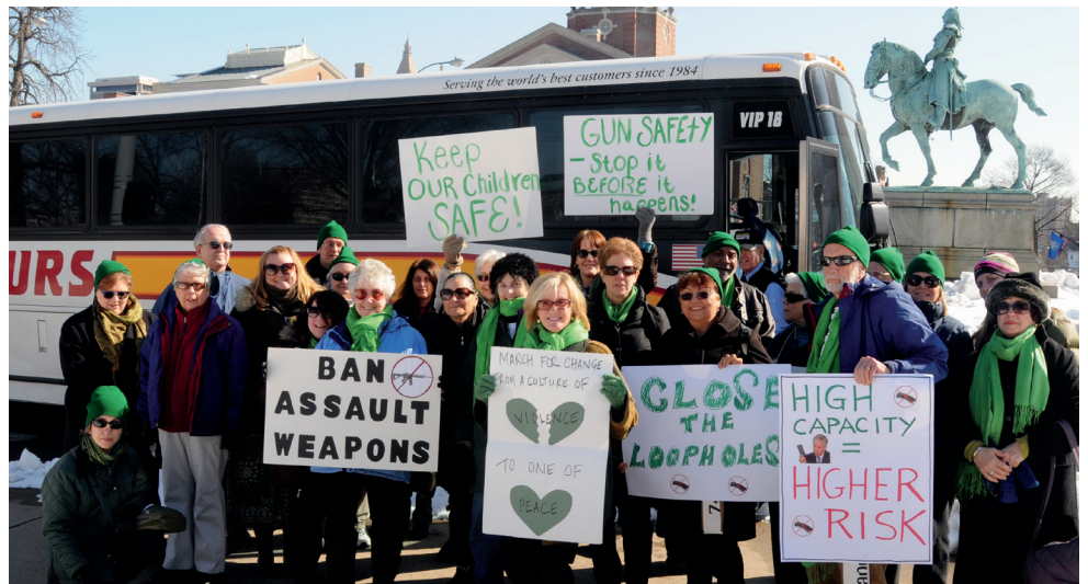
A Bridgeport delegation, including many BCAC members, arrives at the March for Change in Hartford on February 14th.