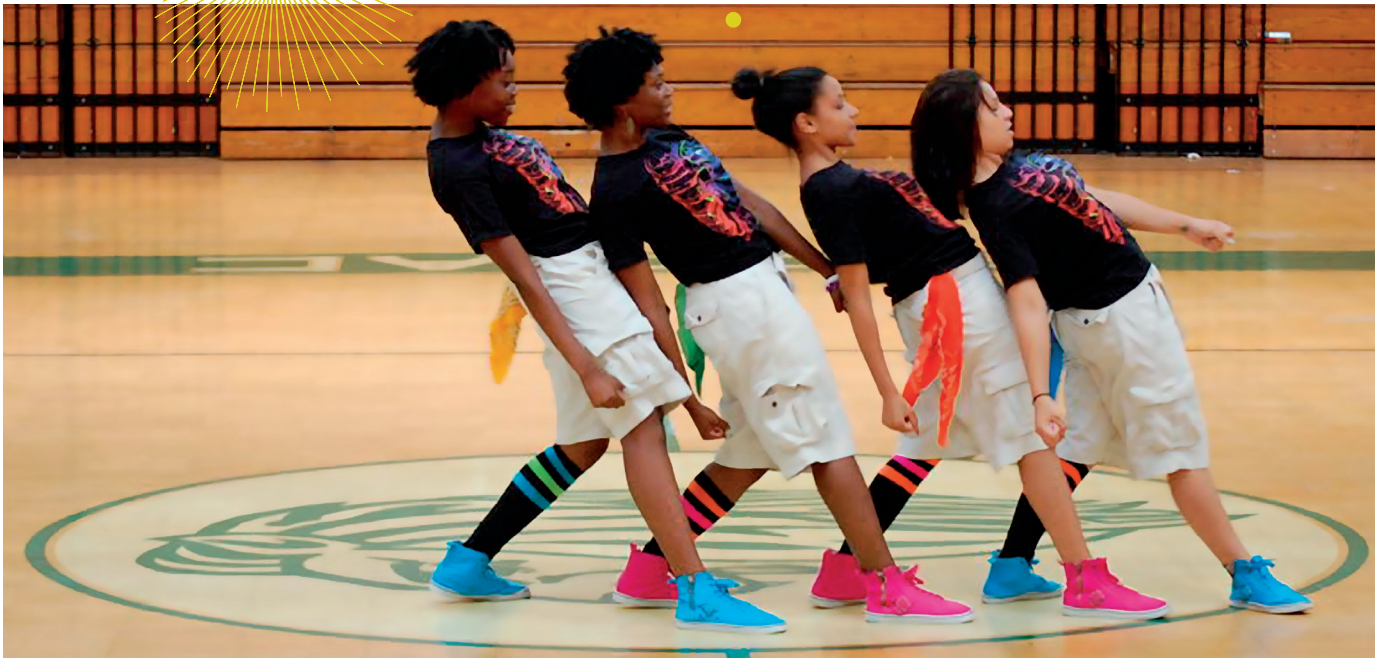
BCAC works to create systems change that improve outcomes for all Bridgeport youth. Pictured here are members of Bridgeport's Bassick High School dance team.